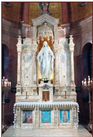
Miraculous Medal Shrine