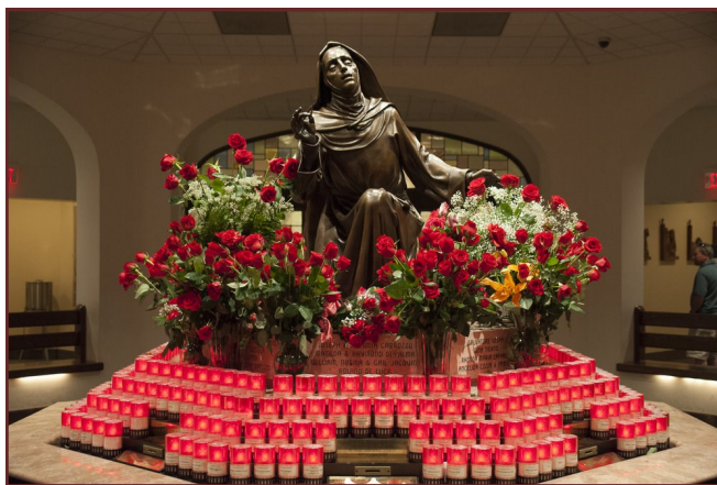
St. Rita of Cascia Shrine